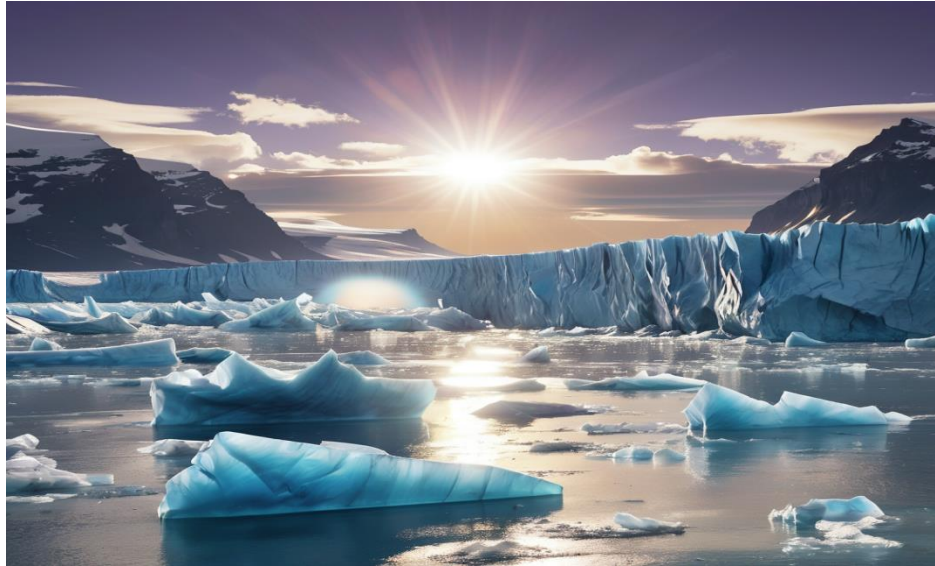
Figure-1 Glacier melting due to heat effects