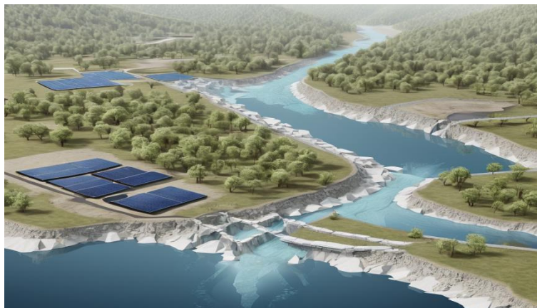
Figure-5 Reforestation and afforestation efforts help sequester carbon dioxide from the ecosystem

Incorporating those mitigation and edition measures calls for a collaborative method concerning governments, businesses, and civil society. International cooperation is crucial, as climate exchange is a international difficulty that transcends countrywide borders. Financial and technical support from developed nations to growing nations can help bridge the distance in assets and talents had to put into effect effective techniques. Moreover, integrating clinical research and traditional expertise can decorate the effectiveness of those measures, making sure they are tailored to local contexts and conditions.