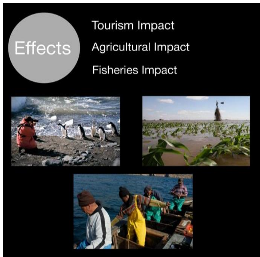
Figure-4 Effect caused due to melting of glaciers all over the world

The monetary consequences of glacial melting expand beyond agriculture to effect neighborhood economies reliant on tourism and fishing industries. Glacial landscapes draw travelers searching for pristine environments for activities such as hiking, mountaineering, and glacier tours. Yet, the retreat of glaciers diminishes the cultured and recreational price of those landscapes, ensuing in a decline in vacationer visits and economic revenue for neighborhood agencies depending on tourism. Similarly, fisheries in glacier-fed rivers revel in disruptions as changes in water temperature and float styles affect fish populations and spawning habitats. These disruptions impact both industrial and leisure fishing industries, reducing income possibilities for fishing communities and jeopardizing cultural traditions tied to fishing practices Figure-4.